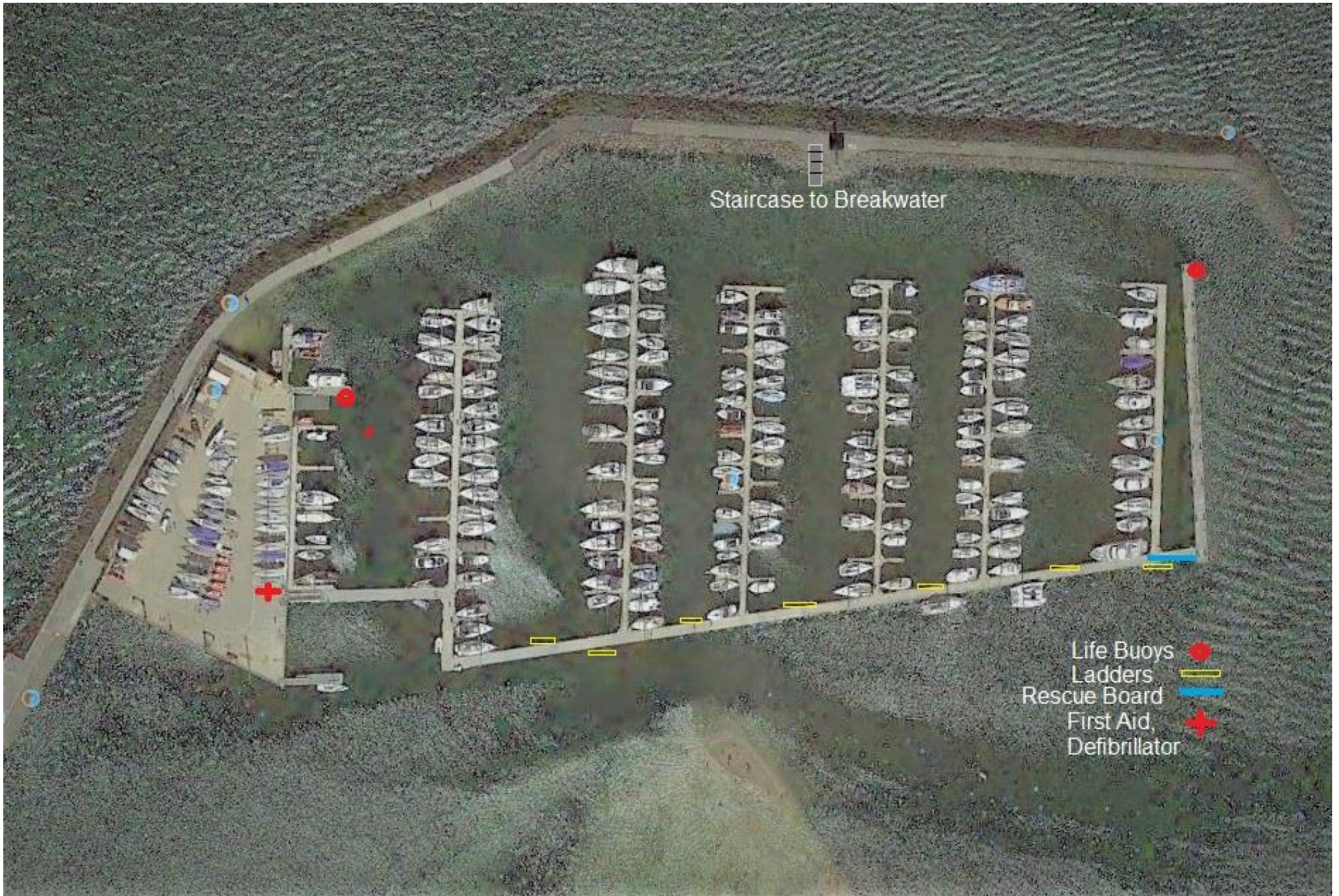
Marina Safety Plan